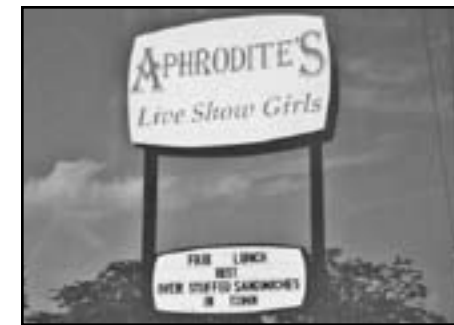
The Pornography of Everyday Life

The film illustrates how the pornographic worldview is a generally accepted discourse, a habitual mode of thinking and acting that underpins not only sexism, but also racism, militarism, physical abuse and torture, and the pillaging of the environment. As such, pornography appears not only in overt, "hard-core" forms, but also in virtually every aspect of everyday life.