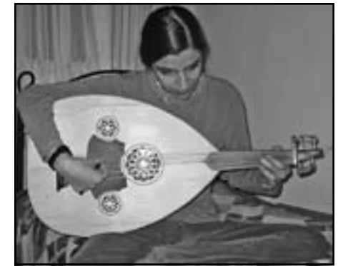
A World Without Strangers

Cover background image from Womanhood and Circumcision (see page 9).