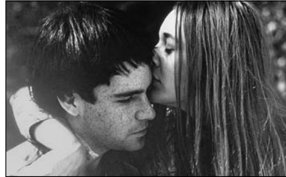
Gender and Communication: Male-Female Differences in Language and Nonverbal Behavior