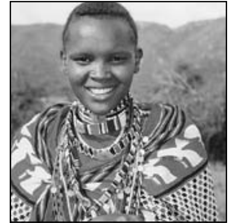
Womanhood and Circumcision

60 min. Color 2003 #0016 Sale: VHS or DVD $295, Rental: $95