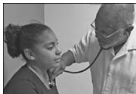
Roots of Health

Roots of Health will engage and inspire students and engender thought, analysis, and classroom discussion. It will powerfully enhance a variety of classes in sociology, women's studies, and public health. It was produced by Linda Harrar Productions and is closed-captioned.