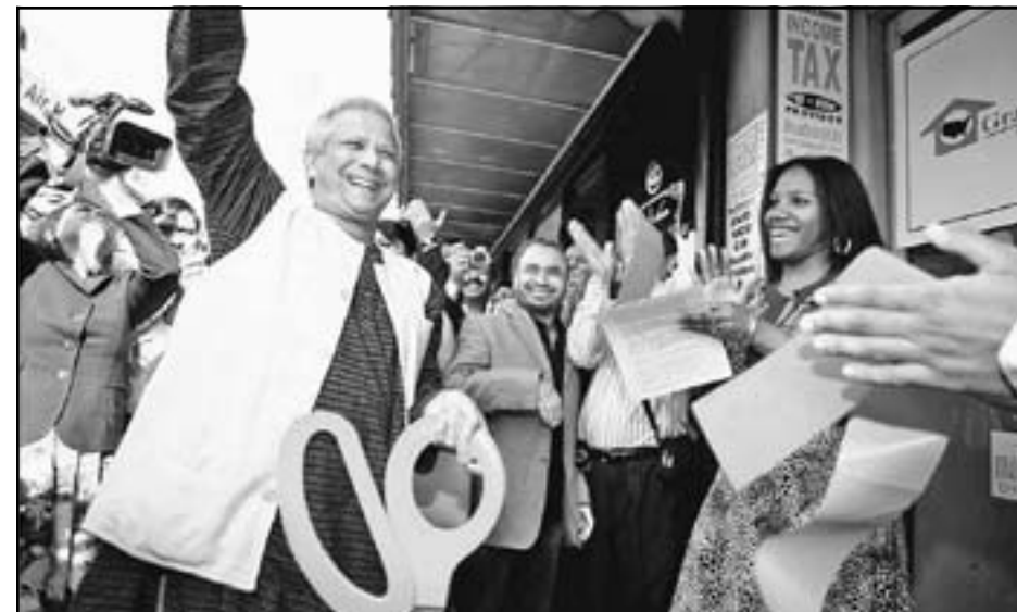
To Catch a Dollar: Muhammad Yunus Banks on America

56 min. Color 2009 #0172 CC Sale: DVD $275, Rental: DVD $95