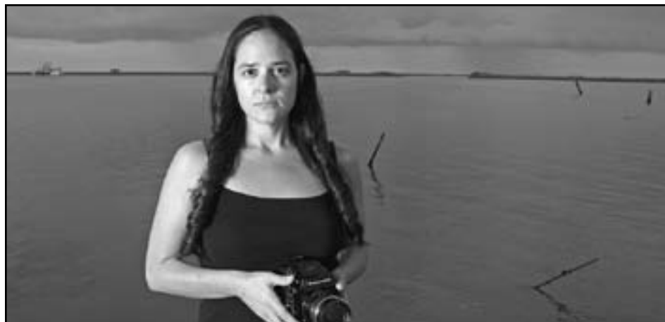
My Louisiana Love