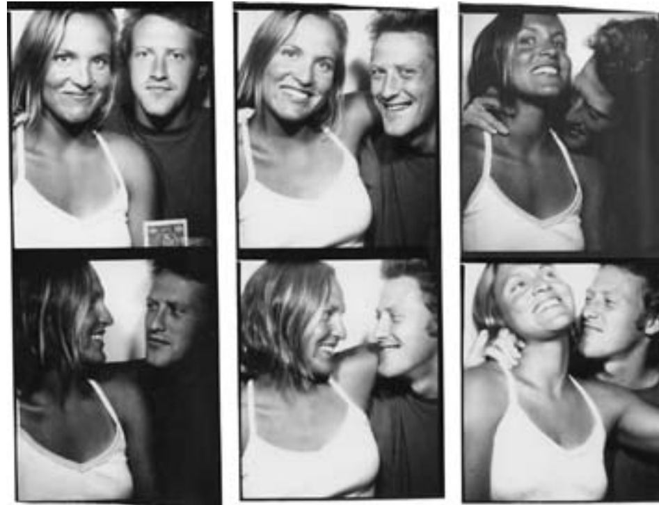
Gender and Relationships: Male-Female Differences in Love and Marriage