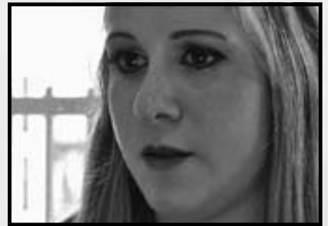
A Civil Remedy (page 2):

"This riveting portrait of six men who once were women is the most profound, compelling, and thought-provoking documentary ever made on gender identity."