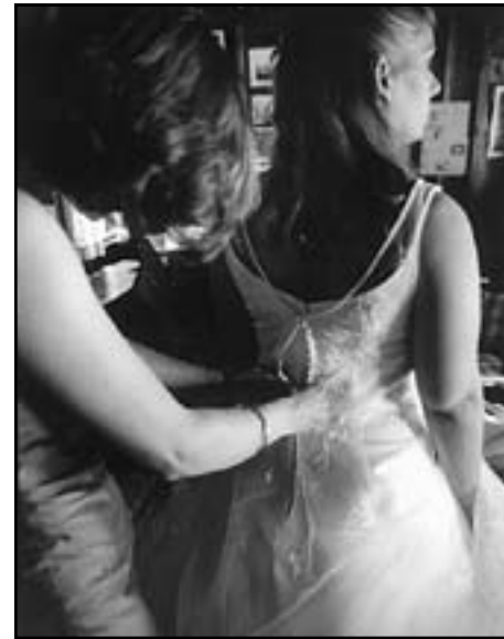
Wedding Advice: Speak Now or Forever Hold Your Peace

At once entertaining and informative and both deeply personal and political, Wedding Advice is sure to capture student interest and stimulate thoughtful discussion in a variety of courses in