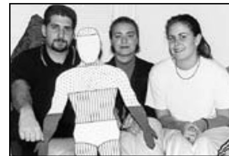
The Human Body: Appearance, Shape and Self-Image

An in-depth Instructor's Guide provides suggested uses of the video, classroom activities, and background and reference materials. Closed-captioned.