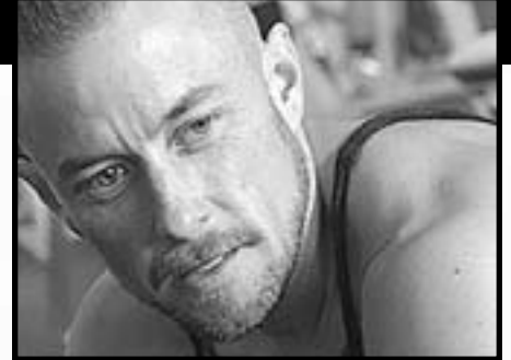
You Don't Know Dick (page 12):

New and Award-Winning Videos and DVDs from Berkeley Media LLC