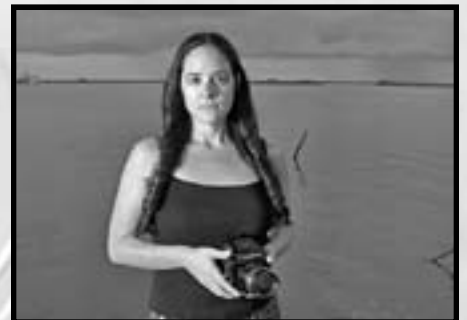
My Louisiana Love (page 4):

"A splendid and eloquent statement about the horrors of sex trafficking and the critical need for change in the legal remedies for the care of the victims of such crimes.... Highly recommended for classroom use in many disciplines!"