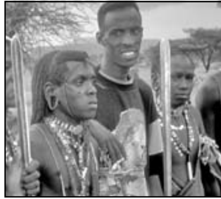
Making Maasai Men

60 min. Color 2007 #0158 Sale: DVD $250, Rental: DVD $95