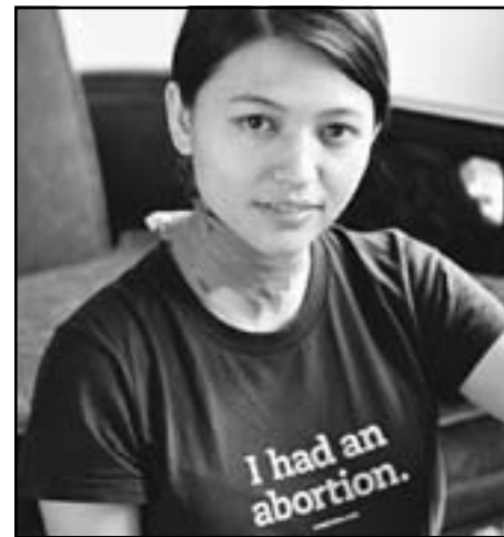
Beyond the Politics of Life and Choice