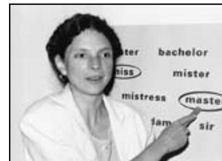
Sexism in Language: Thief of Honor, Shaper of Lies

40 min. Color 1976 #0039 Sale: VHS or DVD $295, Rental: $95