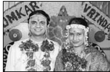
Marriages in Heaven

57 min. Color 2003 #0081 Sale: VHS or DVD $295, Rental: $95