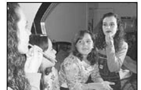
Body Image: The Quest for Perfection