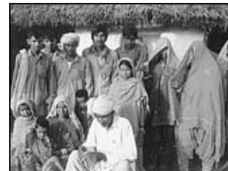
Keep Her Under Control: Law's Patriarchy in India

56 min. Color 1999 #0014 Sale: VHS or DVD $250, Rental: $95