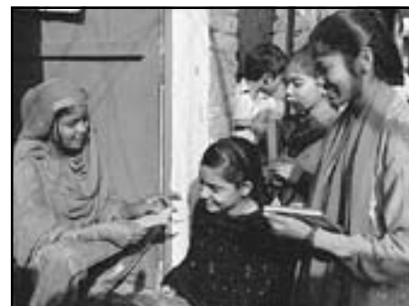
Six Billion and Beyond